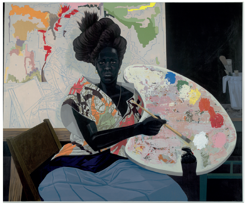
{\small \textcircled{\o}}\ \ Kerry\ James\ Marshall,\ \textit{Untitled}\ (2009).\ \